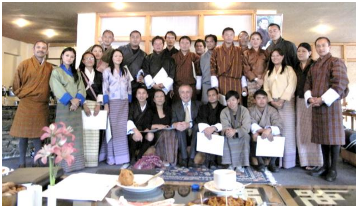
Certification Ceremony in the "Bhutanese Kitchen" on October 16, 2011 in Thimphu

training, namely working cum studying, could be designed. Hence, a public private partnership approach was conceptualized, including Tourism Council of Bhutan (TCB), RGoB, HWZ University of Applied Sciences for Business Administration Zurich, and the various hoteliers in Bhutan. Thoughts were given on a variety of issues, such as the relevant and practical oriented curricula, an attractive time schedule during off-seasons, the calculation of the European Credit Transfer System (ECTS) points for the international recognition of the diploma, the design of admission criteria, the establishment of exam and study rules, and the role of hoteliers as employers of the students as well as partners of the project. As a novum: The hoteliers are paying the salaries to the students during the training periods. And last but not least, RGoB provides the managerial staff and facilities for the training. Based on this feasibility study Jacobs Foundation and Elysium Foundation (both Switzerland) were convinced to support the project substantially.