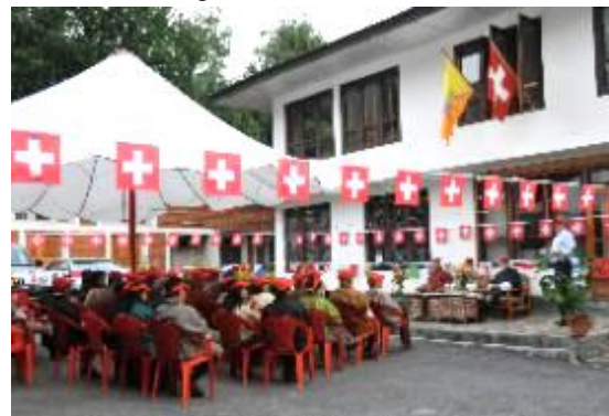
General Assembly of BSS at Helvetas Thimphu

the main tasks ahead for BSS will be to register the society in Bhutan. A draft of the articles of the Association exists already. A new logo has been designed.