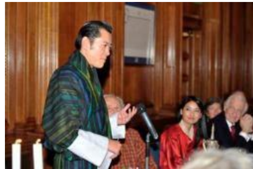
His Majesty the King

• The Annual Dinner to celebrate the 20th Anniversary of the Bhutan Society of the United Kingdom was held on November 25th 2011 in London. Their Majesties the King and Queen of Bhutan, who were on a private visit in the UK, joined to celebrate and turned the event into a very auspicious occasion. The dinner was arranged in the distinguished surroundings of the Hall of the Honourable Society of the Inner Temple in the City of London. The chairpersons of all the Bhutan Friendship Societies in Europe were invited.