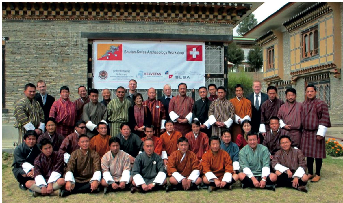
Participants of the first Educational Workshop on Archaeology, spring 2011